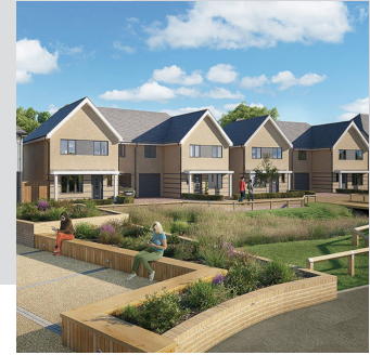
Bellway Welwyn QE2