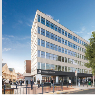
Galliard Rosebery House