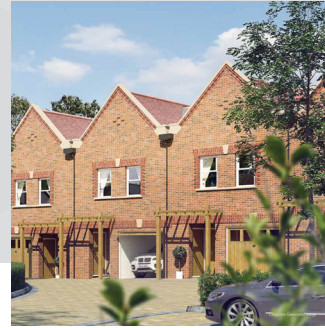
Linden Mill Hill