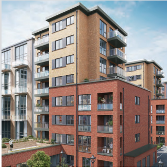
Bellway Acton Square